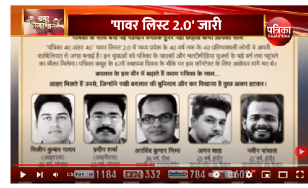
Patrika 40 Under 40: पावर सिस्ट 2.0 के विजेताओं के नाम घोषित