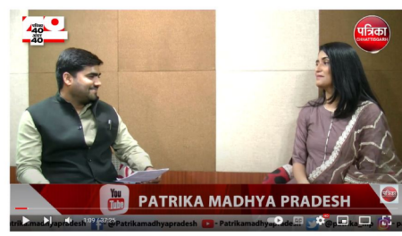
पत्रिका 40 अंडर 40 पॉवर लिस्ट की विजेता से खास बात